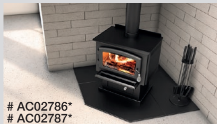
# AC02786* # AC02787*